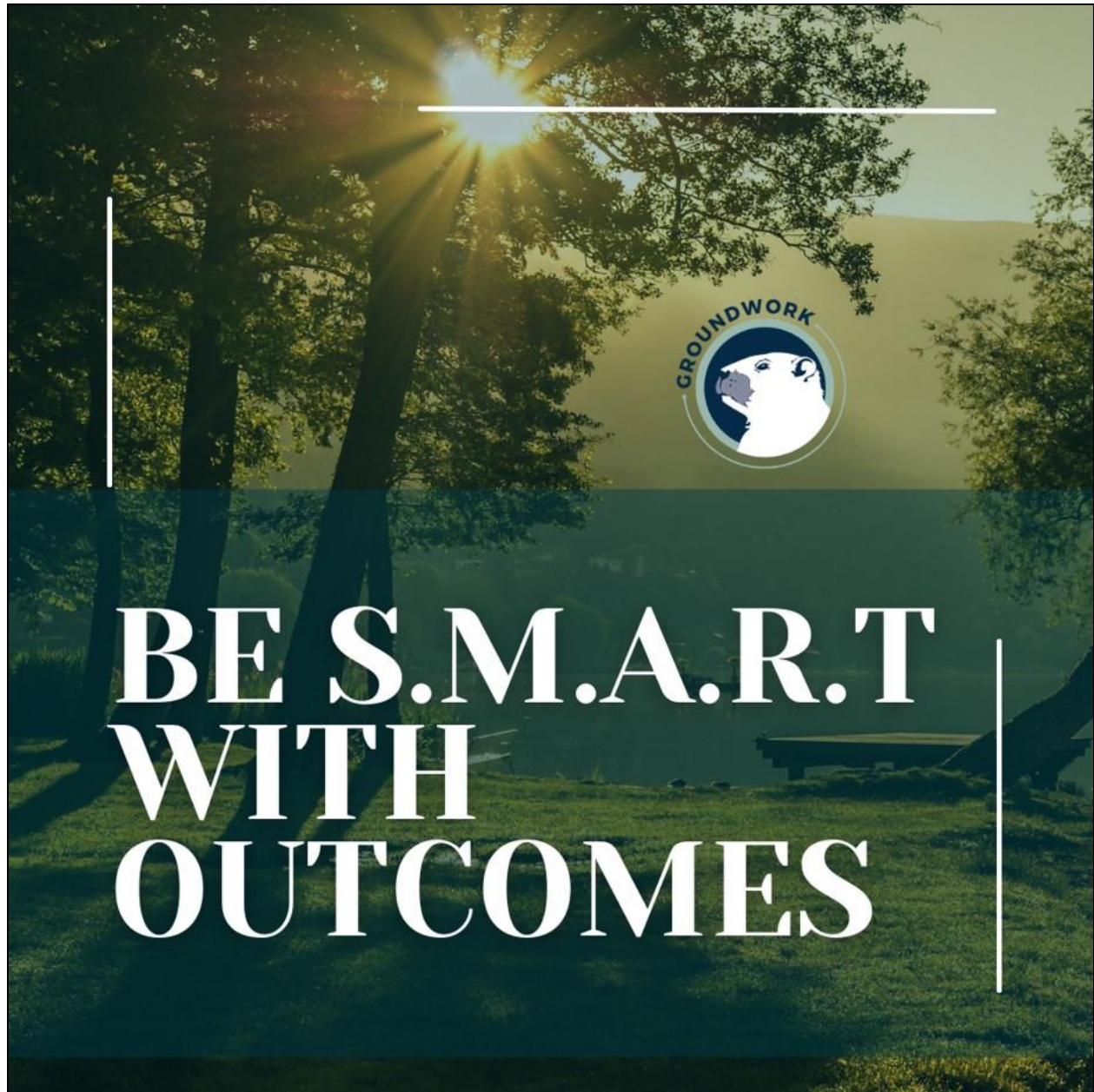
Figure 40- Template Created by Savannah Lawrence