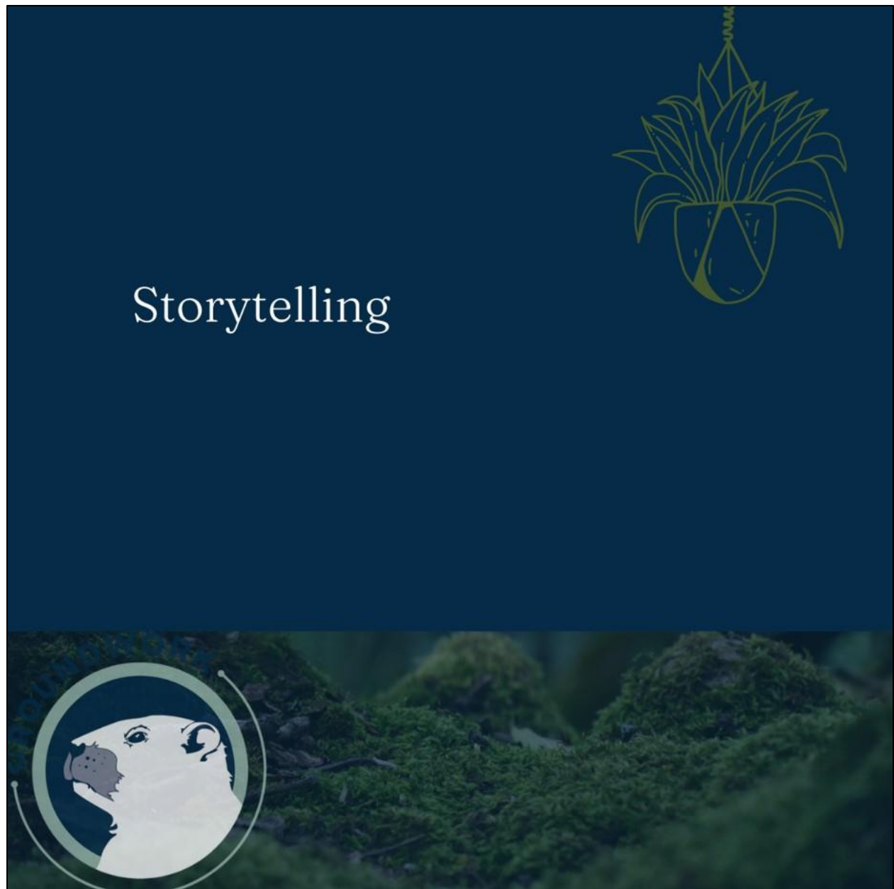
Figure 34- Template Created by Savannah Lawrence