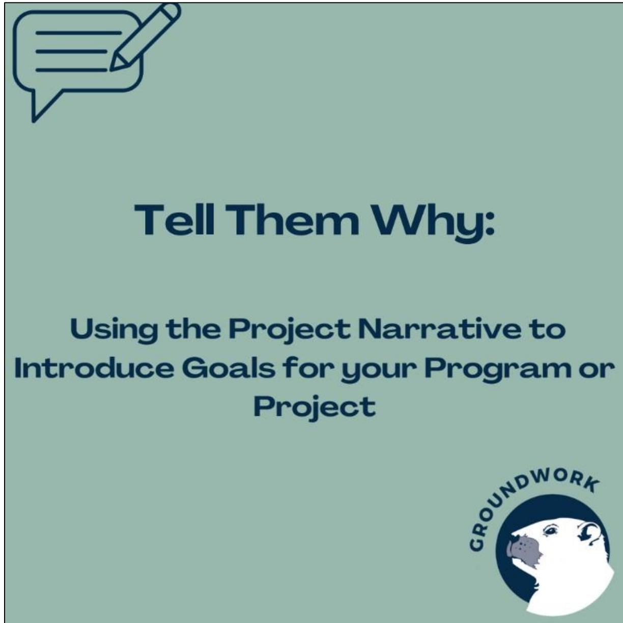
Figure 30- Template Created by Savannah Lawrence